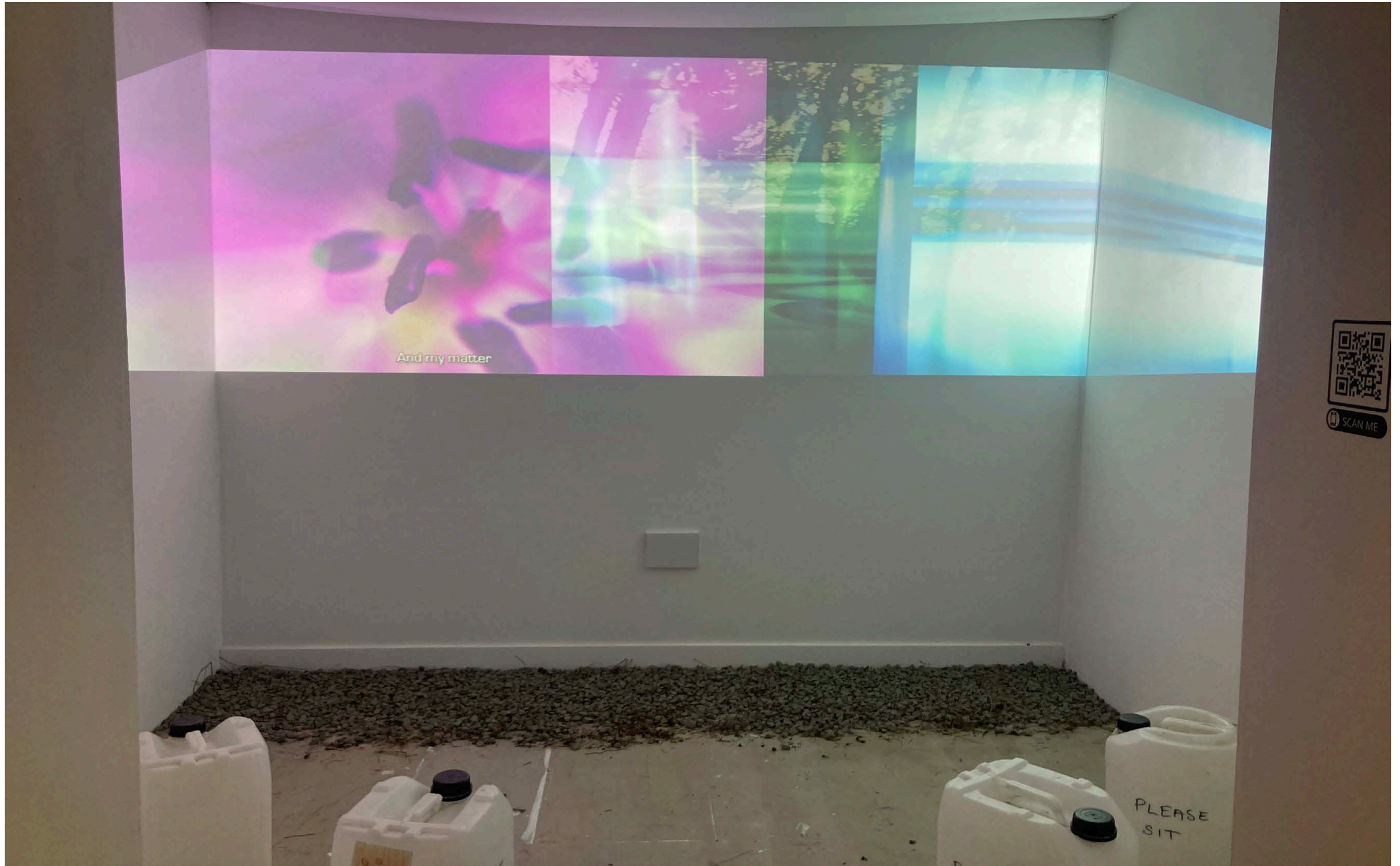
MATTER LAND - Video installation / 2 projections/ water storage containers & gravel https://drive.google.com/file/d/1OtKdaBJ2ozKSc_TjE5uxRiv0rztXhkFf/view?usp=sharing