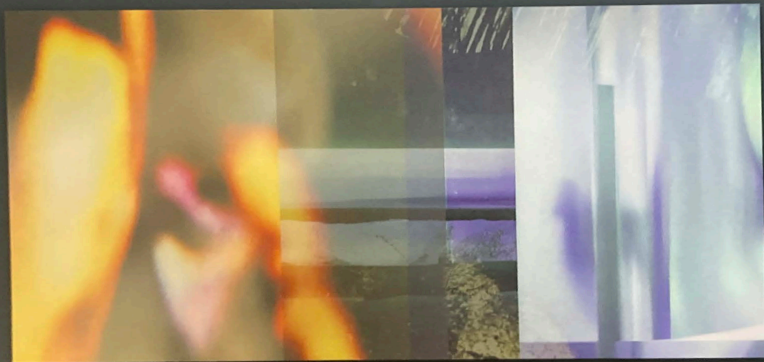
MATTER LAND _ ALWAYS SOMEWHERE Digital print on Art Fibre Paper mounted on Aluminium 150X95cm