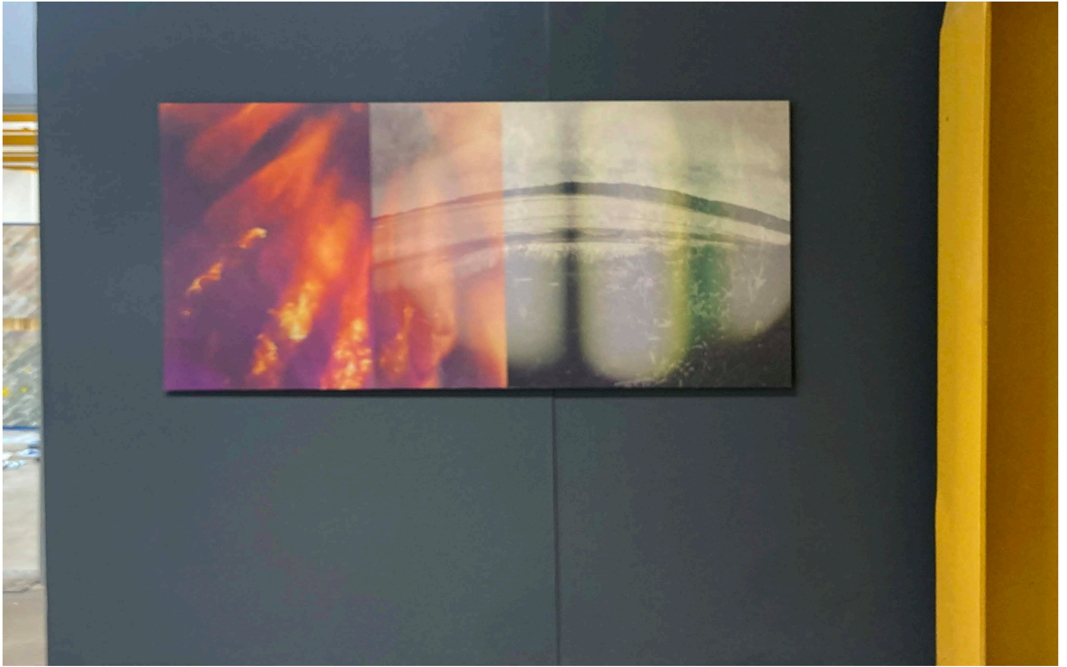
MATTER LAND _ ALWAYS SOMEWHERE Digital print on Art Fibre Paper mounted on Aluminium 150X95cm